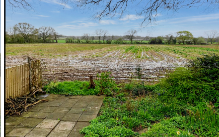
Pitch Fee: approx £216.38 per month Subject to Annual Review Council Tax Band: 'A' Tenure: